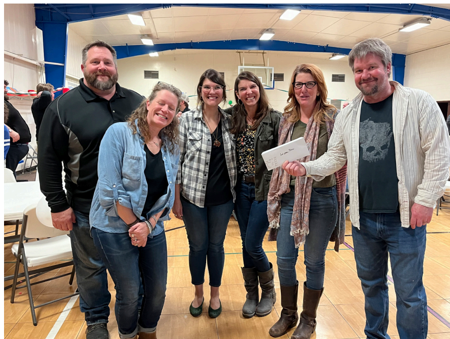
The 2nd place Trivia Team! Way to go!