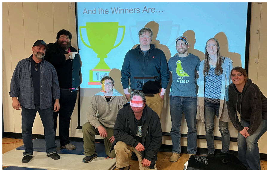
The 1st place Triva Team! Congrats!

purchase necessary supplies, and set up the gym. Mostly, without the many contestants who came out and supported us, this would not have taken place. The 7th and 8th Grade students thank you for supporting their fund-raising efforts to visit two historic sites in Michigan and the Soo Locks. It really takes a village - Washington Island "village" to be exact!